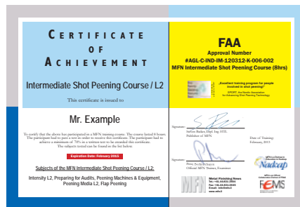
INTERMEDIATE/Level 2 Certificate indicating FAA Ref. No.