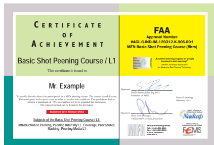
BASIC/Level 1 Certificate indicating FAA Ref. No.